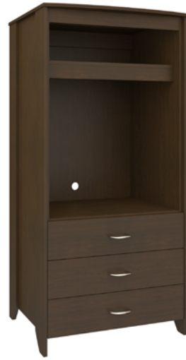
Model: EXAMTV30 34.75W 24.75D 72.25H

The contemporary Essex collection features a distinctive leg design providing a dimensional look that allows for easy cleaning. Select tone-on-tone or contrasting wood-grained finishes for legs and top. Customizable and available in a variety of sizes. Sophisticated hardware delivers added style.